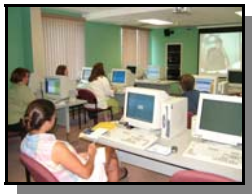
Located at the NHPTV Broadcast Center in Durham, the Technology Learning Lab will accommodate up to 14 educators.

Our trainers are available to come to your school or district. You can select a workshop from our scheduled offerings or we can design training to meet your specific needs. A full-day workshop is $350 and half-day session is $200.