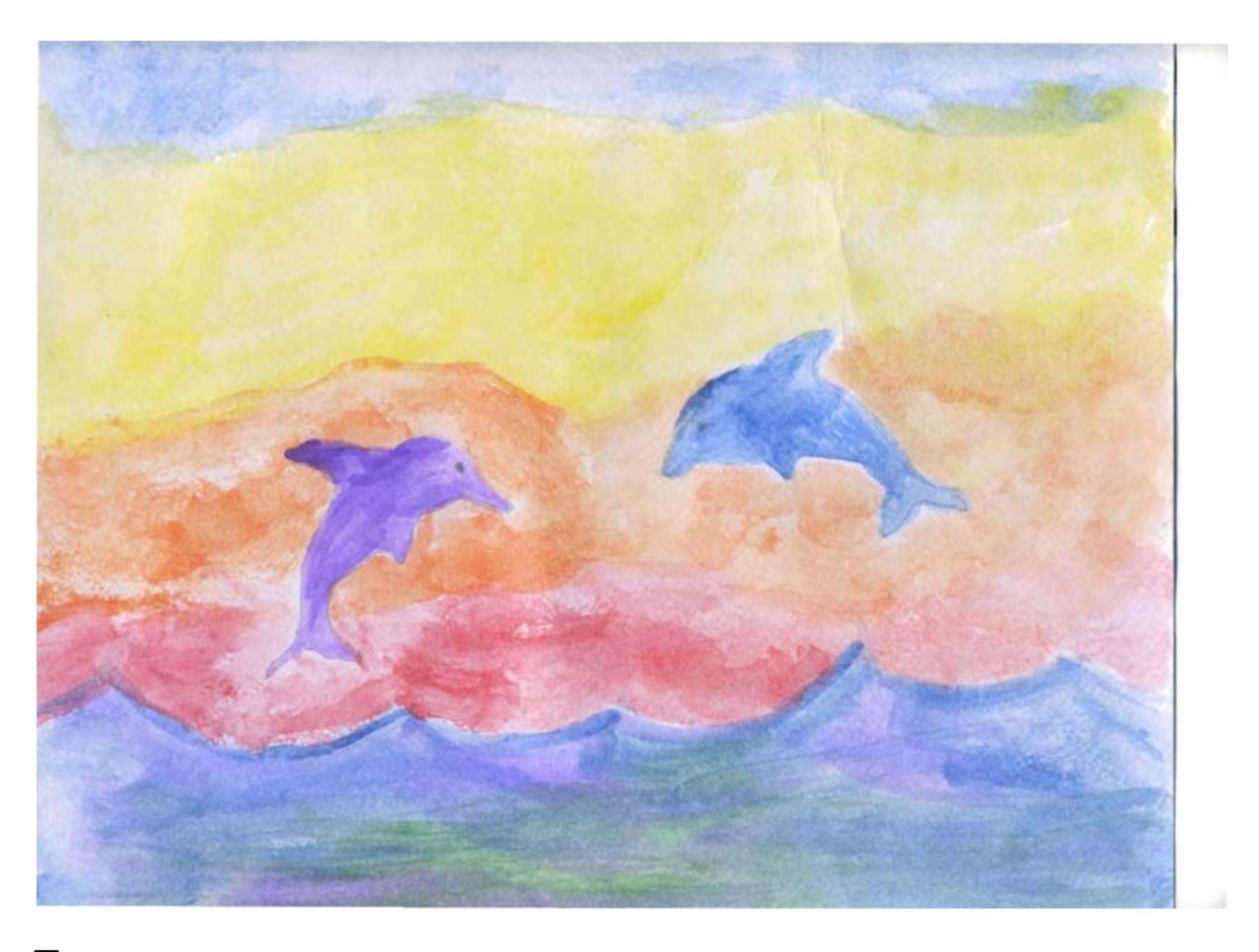
Two dolphins are swimming in a pod, leaping out of the water, off the coast of Cape Cod.