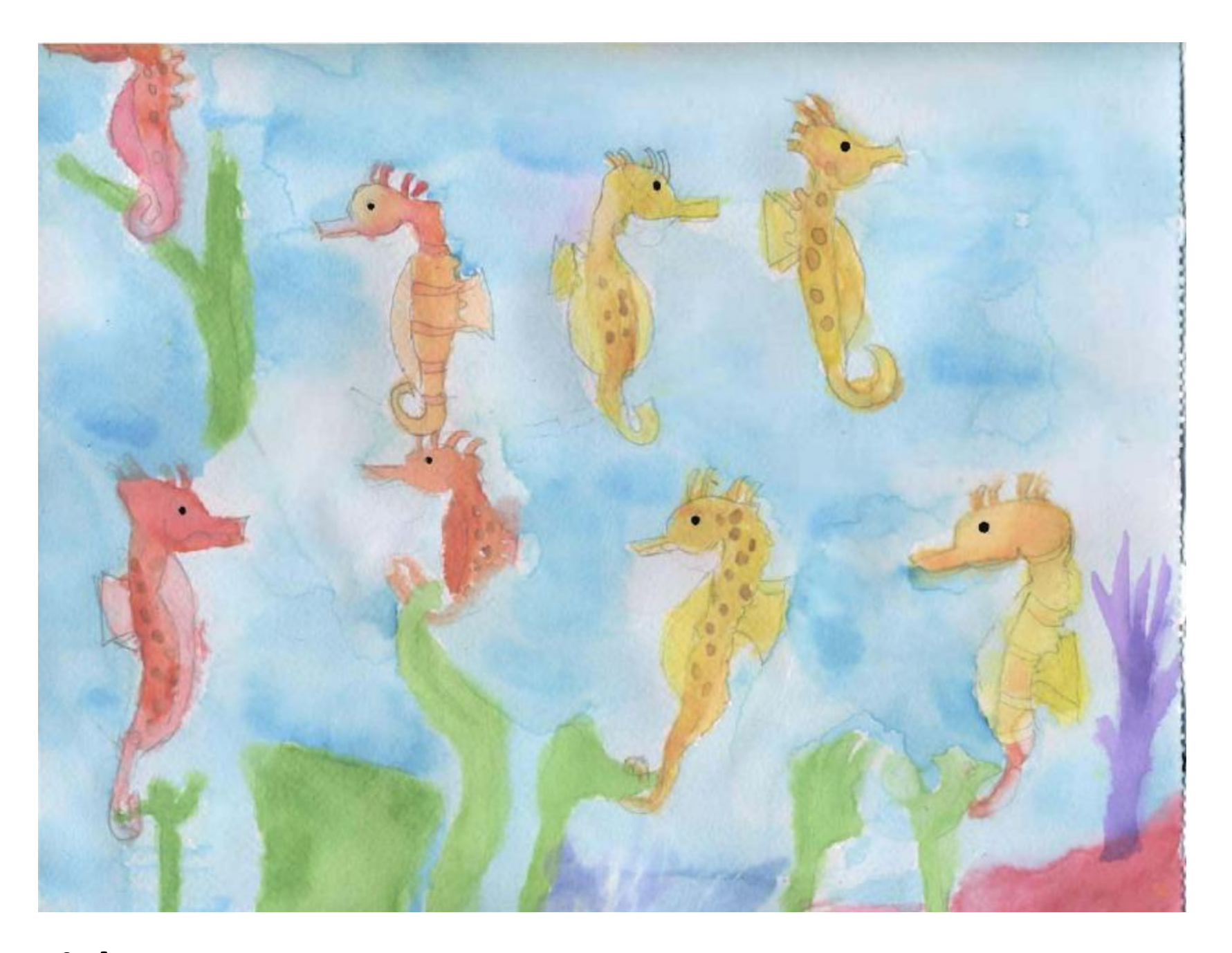
Eight colorful seahorses gliding slowly through the sea, with tails curled around seaweed, they are so pretty.