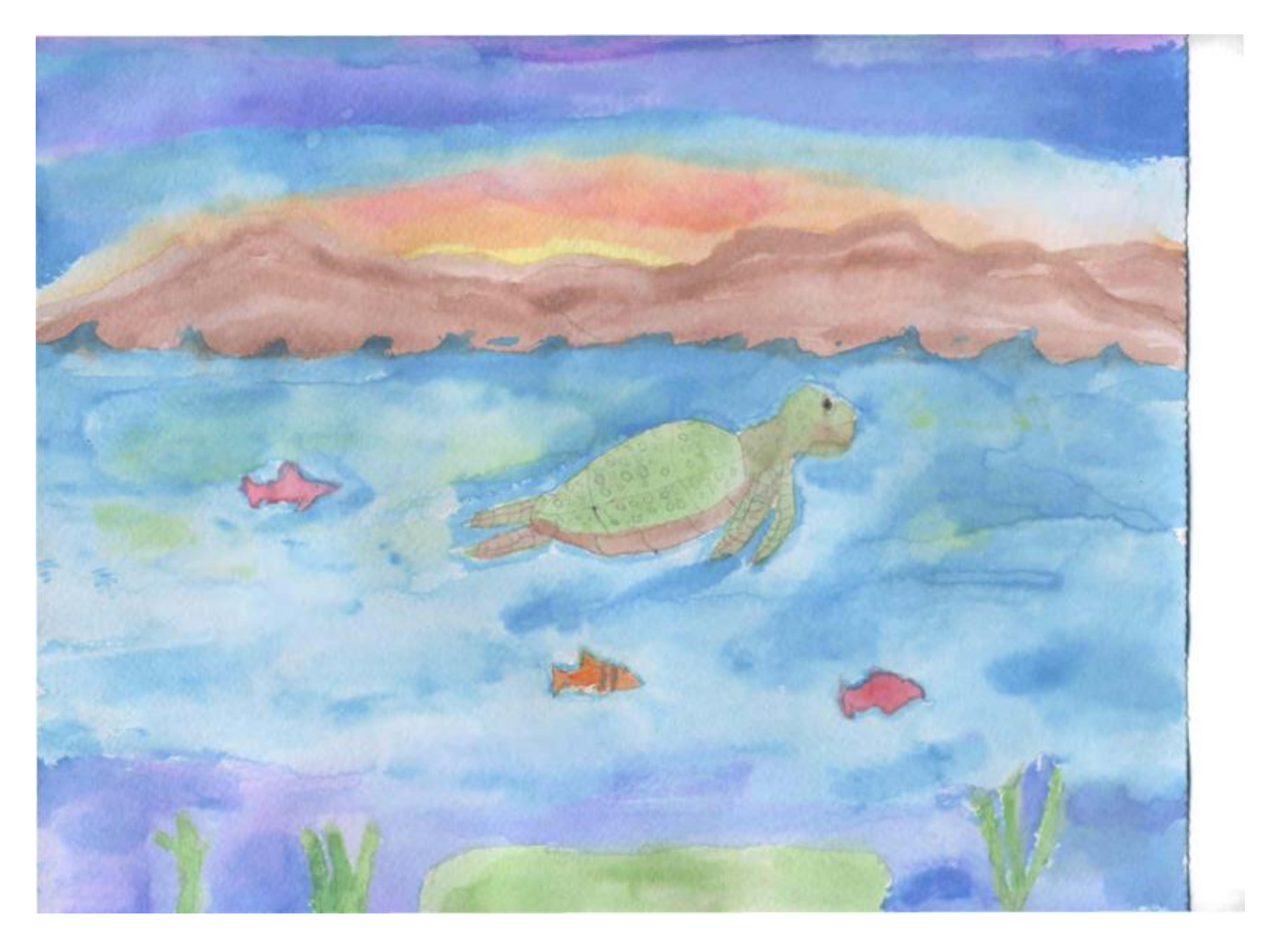
One green sea turtle is swimming in the sea, searching for his next meal, sea grass and algae.