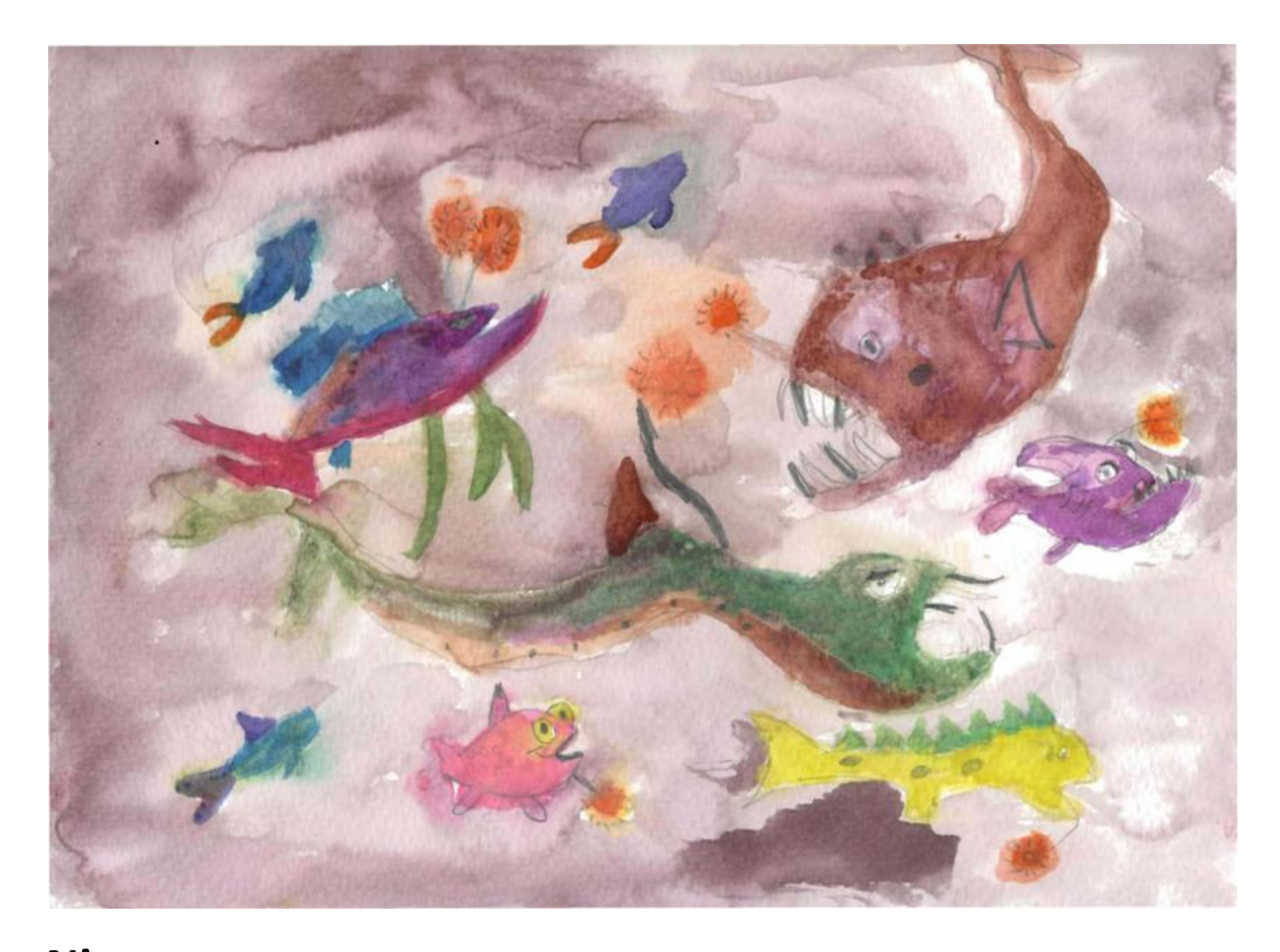
Nine mysterious fish at the bottom of the deep sea, some with lights and sharp teeth, they look scary!