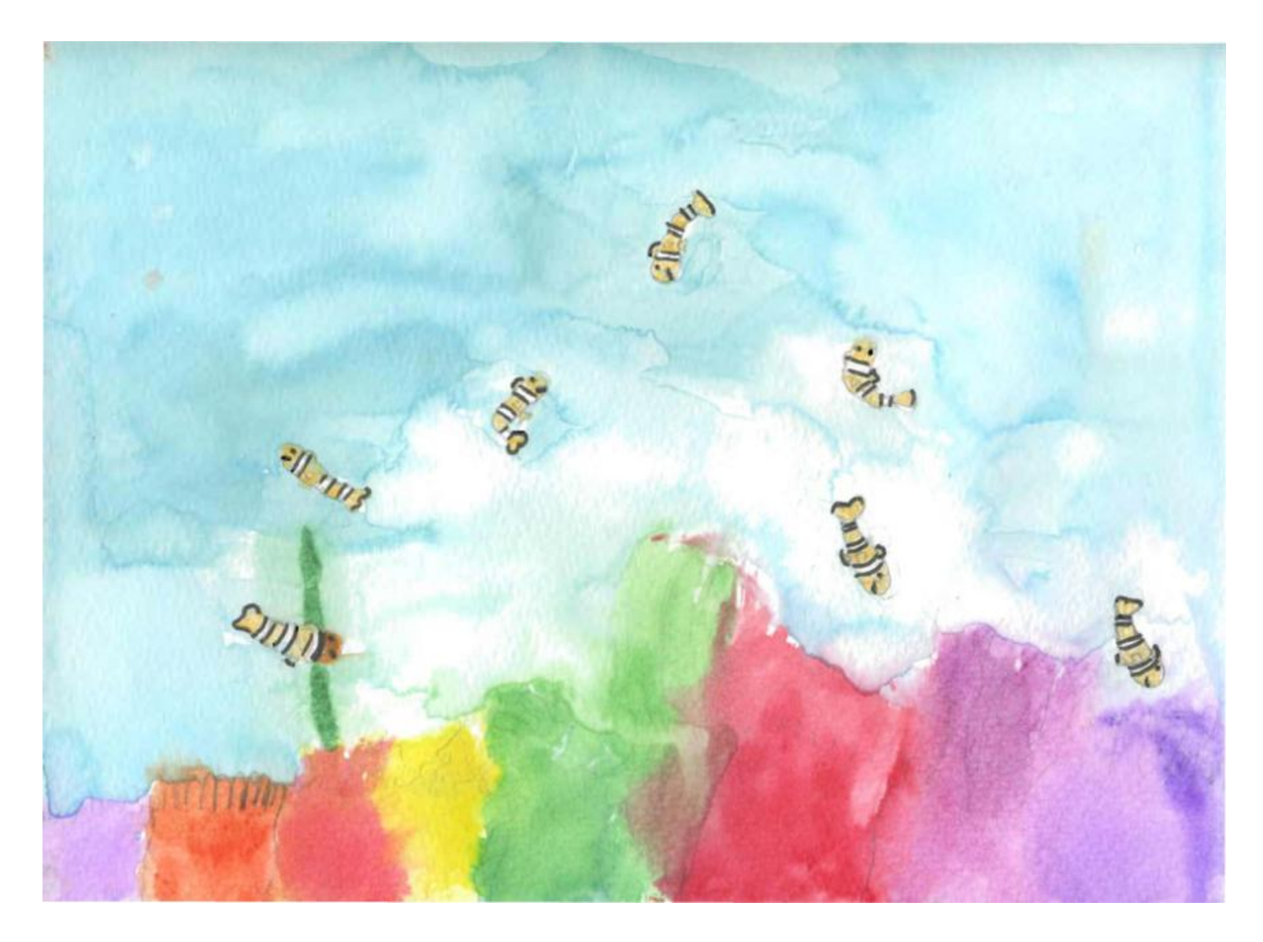
Seven clown fish are at the bottom of the sea, in the coral reef, among the colorful anemone.