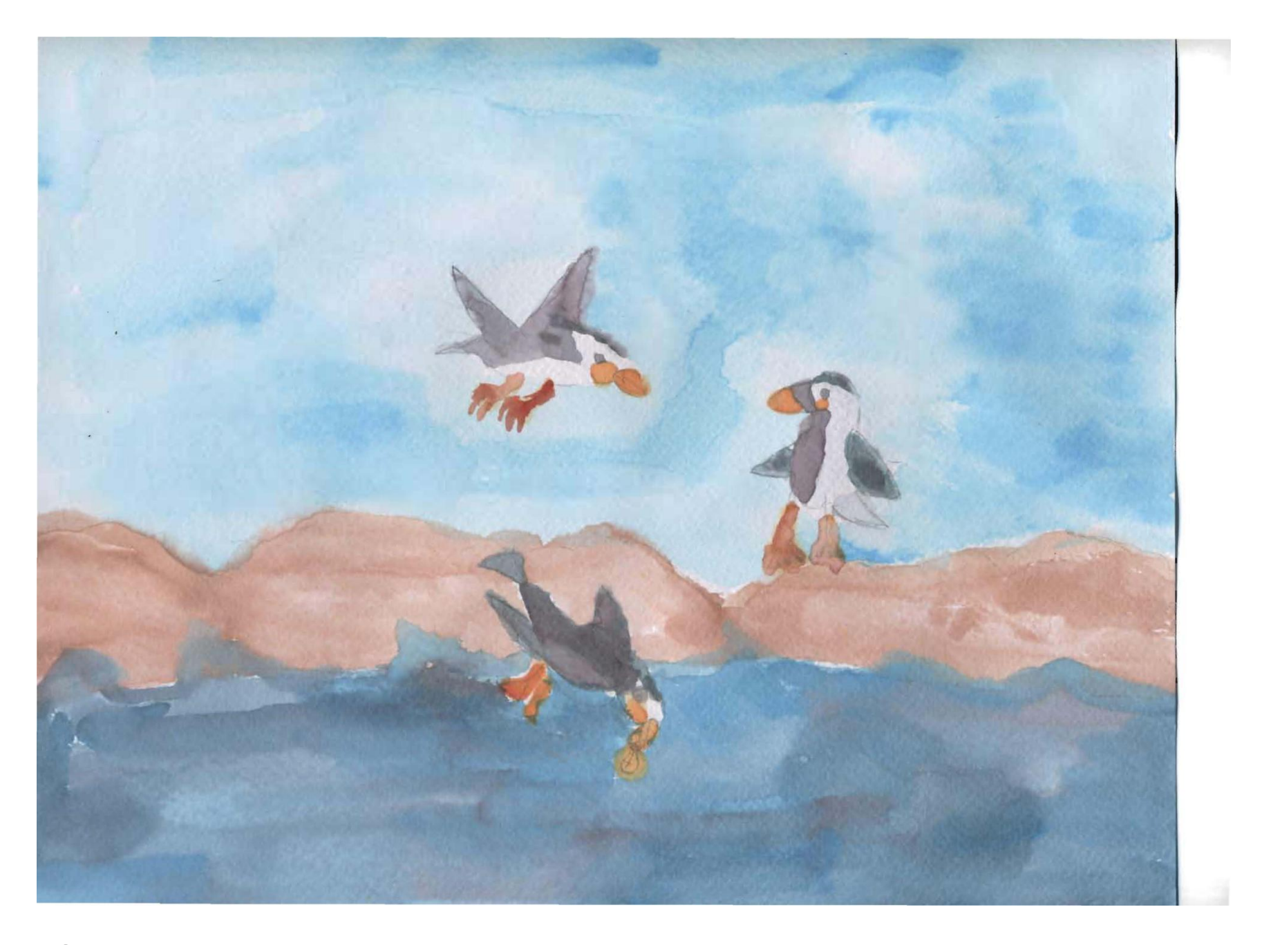
Three Atlantic puffins that have bills orange-red, are diving down to the ocean to be fed.