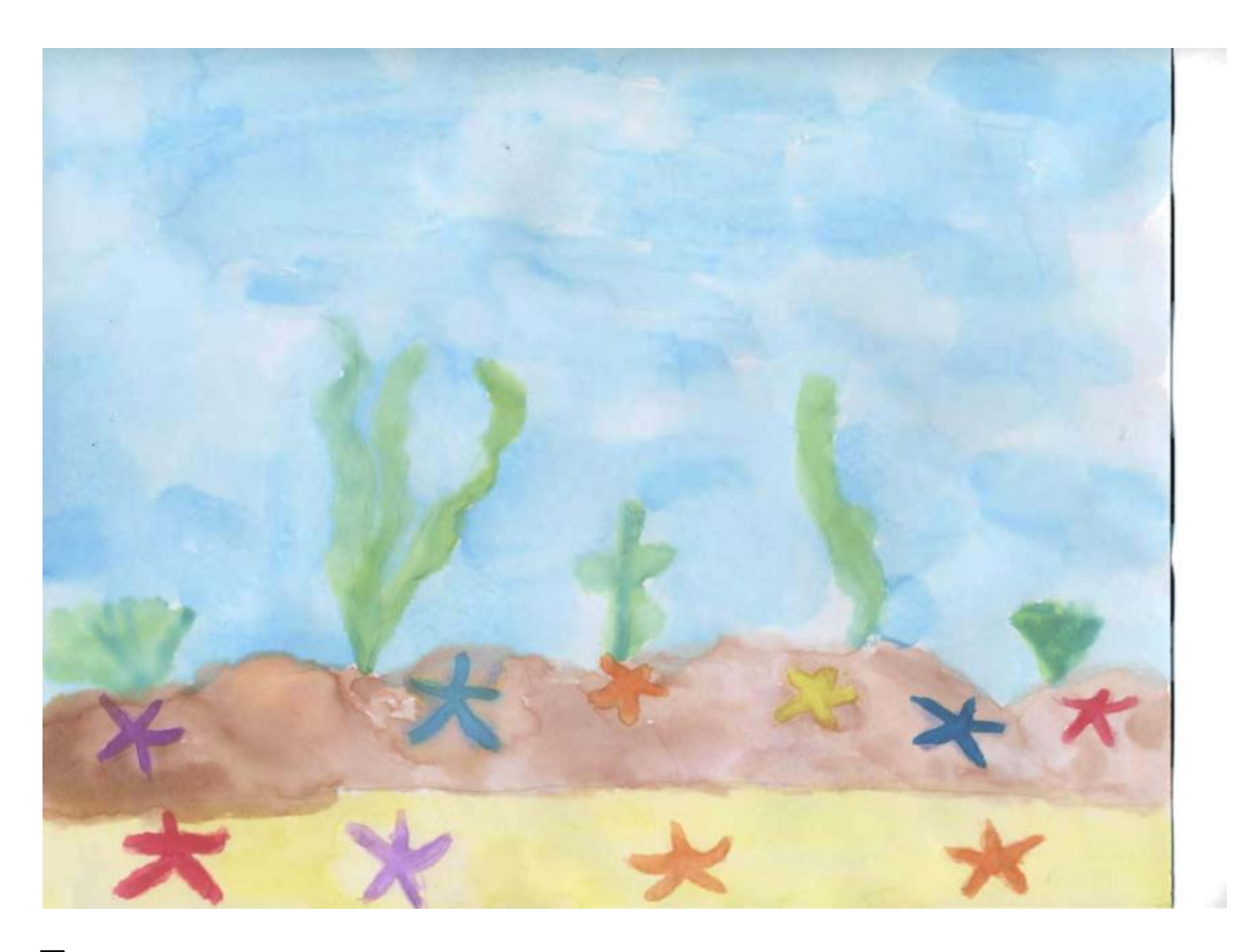
Ten beautiful sea stars found on every ocean floor, who could ask for anything more?