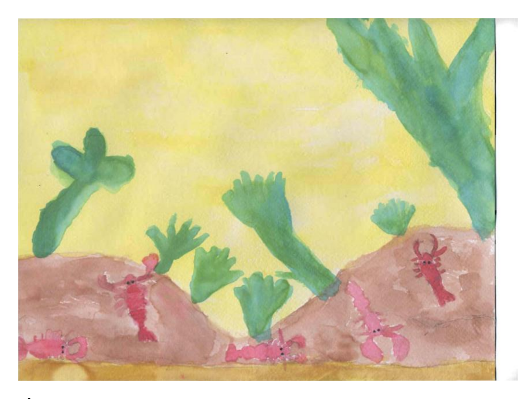
Five lobsters off the coast of Maine, living under rocks and in shallow sandy lanes.