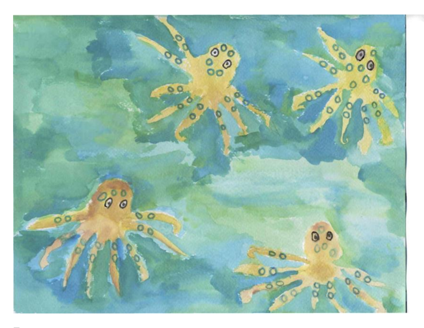
Four octopuses with rings that are blue, all their arms together equal thirty-two.