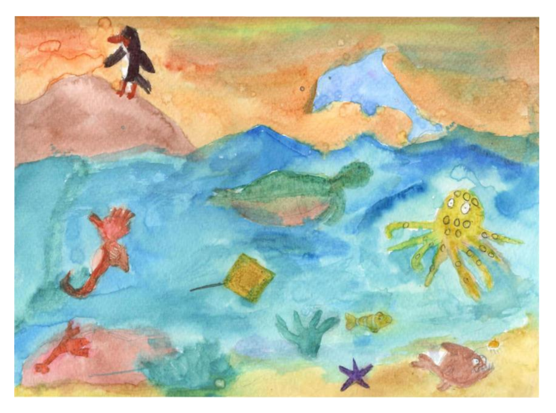
Many animals living in the sea are swimming, playing and eating – happy to be free.